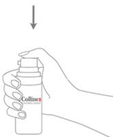
Step 2 - Étape 2